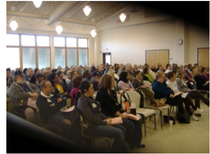
Bus Driver Workshop

One of the Board's main goals was to provide members with a variety of training opportunities. Throughout the year, training sessions were scheduled both regionally and state-wide. Our first one day conference, Friday Focus, had a format similar to our traditional three day conference. Supervisors as well as drivers took advantage of the School Bus Driver Workshops that were held in both the southern and northern areas of the state. Regional Directors arranged for meetings within their own regions and there were two General Membership Meetings. The presenters at these training sessions included Dick Fischer, Tia Dix, Jo Mascorro, Sue Shutrump, Stephen R. Fogarty, Esq., Dalthea Brown and Brian Perkowski. The Office of Student Transportation and Shared Services provided a review of changes to N.J.A.C. 6A:27. The New Jersey Department of Environmental Protection spoke to us about the diesel retrofit program.